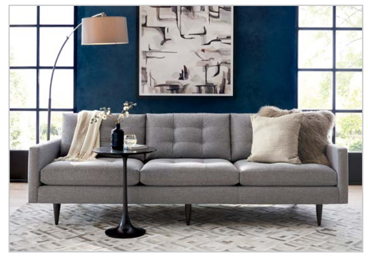
The Petrie Upholstery Collection sofa from Shenandoah Furniture