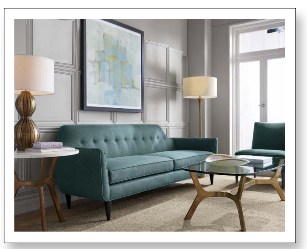
The Gia Sofa and Callie Chair from Shenandoah Furniture have a Mid-Century Modern flair.

and upholstered beds, for leading retailers in this channel, and has a long history of sales and profit growth. In addition to the strong results we expect Shenandoah to contribute to our financial results. we believe we can help Shenandoah grow further, using our financial and management resources to support their strong team. As expected, the acquisition had a slightly unfavorable impact on our FY18 results due to acquisition related costs and the amortization of certain intangible assets but we also expect Shenandoah to be accretive to our earnings beginning in FY19, its first full year as part of Hooker Furniture.