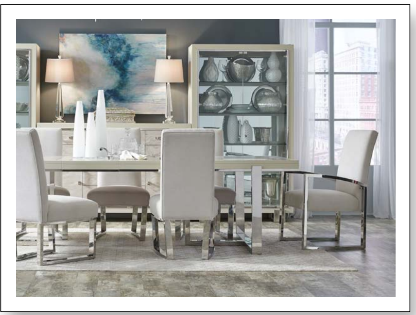
With a heritage of over 60 years, Pulaski Furniture covers the complete design spectrum of traditional, contemporary and transitional styling.

We are generally pleased with our Fiscal 2018 results, with some great successes and some areas which require more work. We are happy to report that sales in the Hooker Brands grew about 5%, thanks to the rebound of the Hooker Upholstery Division, and good growth at Bradington-Young and H Contract. The strength of Hooker Upholstery's recovery, after significant quality issues last year, demonstrates the future potential of that business unit and the value it offers to our customers. The Hooker Casegoods division also grew in FY18, after losing ground in the prior year, on the strength of well-received product offerings. As we expected, the 6% growth we experienced in the HMI segment was above industry average. Much of this growth was thanks to the strong first-year performance of the Accentrics Home unit, but also due to a solid increase at Samuel Lawrence Furniture, which helped offset a decline at Samuel Lawrence Hospitality (SLH).