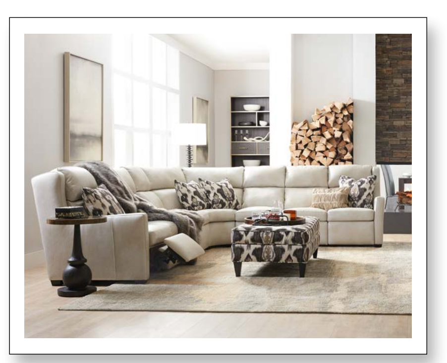
Bradington-Young has become a market leader in the luxury leather motion upholstery category for sofas, sectionals and modular seating.