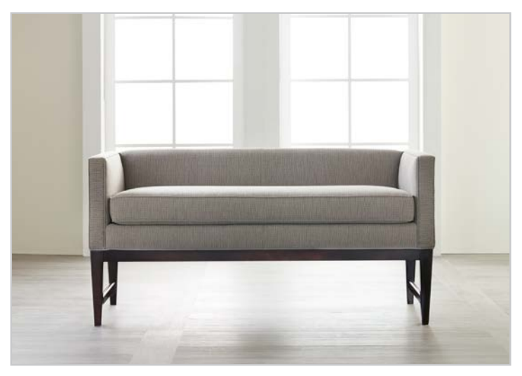
The Kristen Bench from H Contract features an elegant wood base with striking lines and a plush seat with back support.