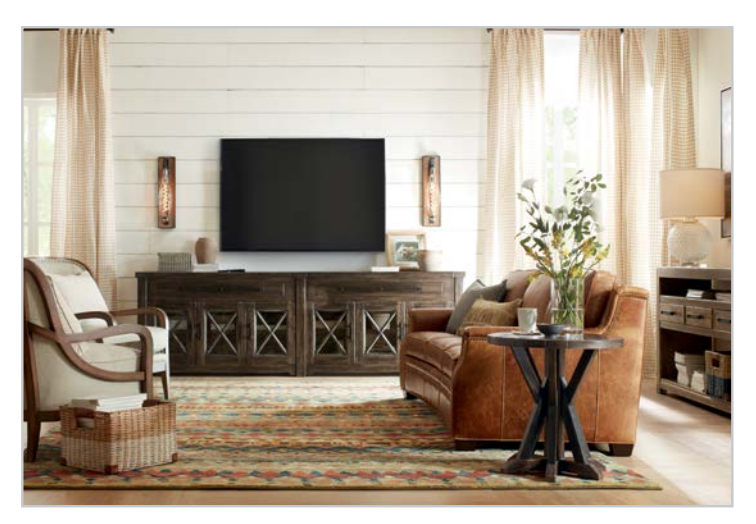
The Roslyn County Collection, part of American Life, is a classic farm-to-décor collection offering heirloom quality with a hand-crafted appeal.

This 2018 Annual Report contains forward-looking statements, including discussions about our strategy and expectations regarding our future performance, which are subject to various risks and uncertainties. Factors that could cause actual results to differ materially from management's projections, forecasts, estimates and expectations include, but are not limited to, the factors described in our annual report on Form 10-K, which is included as part of this report, including under "Item 1- Business—Forward-Looking Statements" and "Item 1A. Risk Factors." Any forward-looking statement we make speaks only as of the date of that statement, and we undertake no obligation, except as required by law, to update any forward-looking statements whether as a result of new information, future events or otherwise.